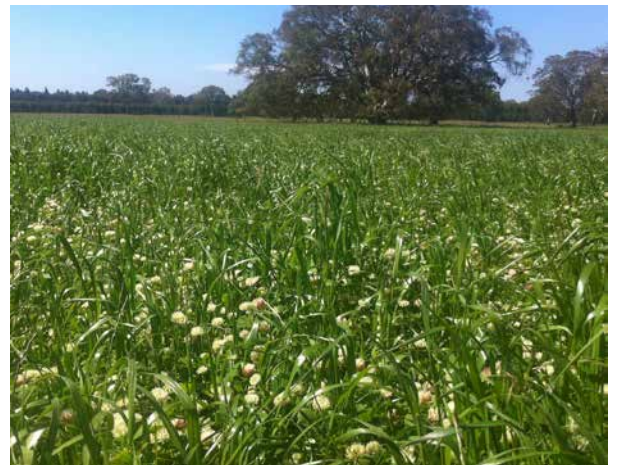
31st October, 50 days after spreading