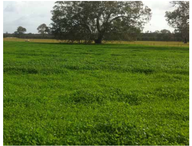
25th September, 14 days after spreading