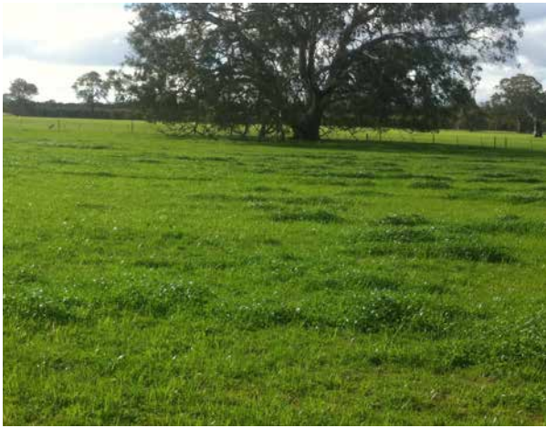
10th September, 1 day before spreading

The photo's below show a potassium responsive hay paddock which received 200Kg/Ha of Hayboosta. This applied 47Kg/Ha of actual potassium nutrient.