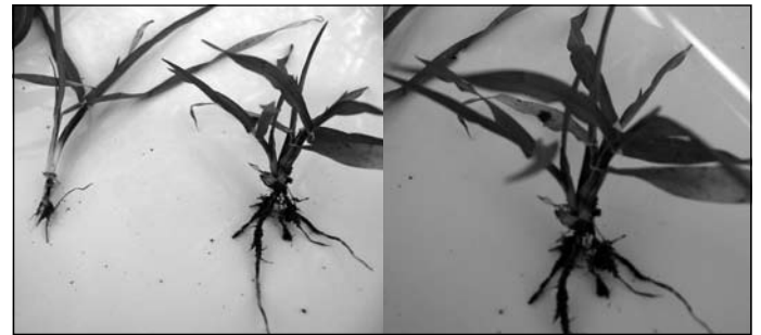
Plate 1 & 2. Phosphorus deficiency: stunted leaves and roots.