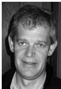
By Bruce Lewis AGRONOMIST Vickery Bros

Nitrogen supply for crops is an important factor in determining crop yield and protein. This year with the favourable start to the season we may well be looking for rainfall and soil moisture to lift crop yield potential. Market preference for higher protein grains will also continue to flow through to quality premiums for higher protein grades.