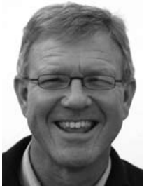
By Harry Armstrong Sales Agronomist

Perennial based beef and sheep pastures in this region require a phosphorus level (Olsen P) in the soil of at least 12-15mg/kg to achieve profitable stocking rates. If the Olsen P is less than 10mg/kg stocking rates will need to be reduced and perennial pastures tend to be much less productive with desirable species failing to persist.