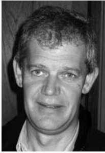
By Bruce Lewis Agronomist

The aim of a drought management strategy is to maintain livestock in reasonable order to maintain production while ensuring the soil and pastures are protected to enable rapid recovery after the break. Reasonable order for optimum production for breeding ewes will mean a condition score of 3. A condition score of 2 would be adequate for dry sheep. There are three major strategic options to consider during a feed shortage; to sell, to agist or to feed. Wethers, culls, and then old breeders should be the order of selling. Agistment is often the cheapest option if it can be found. The practical option for most farmers will be in paddock feeding and possibly followed by confinement feeding to protect soil and pastures from overgrazing.