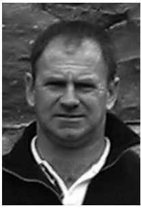
By Bill Feely Sales Agronomist

The drought and dry period that has evolved over the last 3-4 years has certainly placed immense pressure on pastures and pasture management. Therefore it is vital that a procedure is in place to help get our pastures back on track or positioned ready to go immediately after the break.